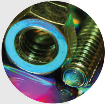
Diconite Dry Lubricated Assemblies